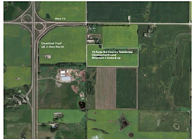
Subject Property 75.07 Acres

75 Acres in MD of Rockyview, a Great INVESTMENT Opportunity, the perfect place to build your dream home, Minutes from Booming Airdrie, Balzac Mega Mall, and 15 minutes from Calgary City Limits. It is Currently Zoned R-RUR / A-SML. With county approval, you may be able to subdivide into 9-15 Parcels. A minimum of 4-acre parcels each and one 13-acre parcel for your dream home. This Beautiful parcel of rolling land offers unobstructed Mountains, partial Calgary views, and a pond. This location has easy access just off Hwy QE2 easy. Minutes from the Cross Iron Mills Shopping Centre in Balzac. Already Zoned for R-RUR / A-SML. The land could be rented to a local farmer. for $95 per acre. Don't Miss this Opportunity!!!!