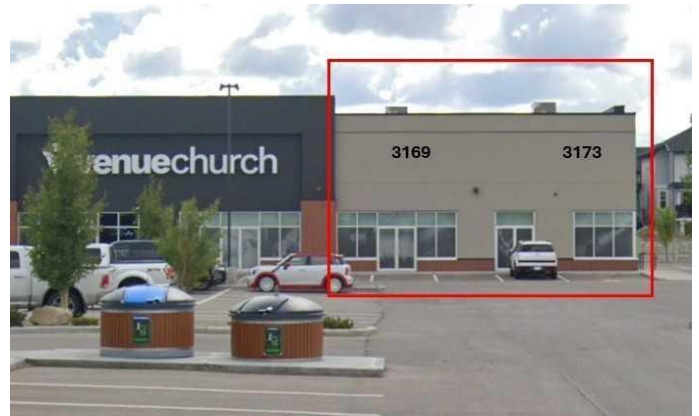
Floor Plan 3169 & 3173 2920 Kingsview Blvd

End cap unit including 2 units and 3557 Square feet of light industrial mixed use! Excellent opportunity for smaller congregation as the current use is public assembly. This unit includes two large store fronts with lots of additional glass on the south exposure, to large overhead doors, independent HVAC units, 20' ceiling height and loads of power. There are many business opportunities under the IB-1 land use bylaw including Business Support Service, Financial Service, Health Care Limited, Indoor Recreation Limited, Office, Restaurant and many more permitted and discretionary uses. You can purchase 1, 2 or 3 units together or individually please call for pricing and unit availability. Possession is estimated for late May 2025.