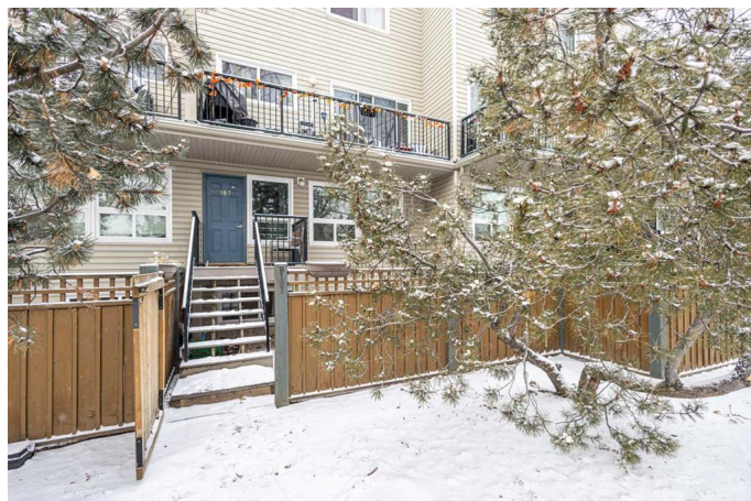
107-3615 49 St NW, Calgary, AB

Main Building: Total Exterior Area Above Grade 404.85 sq ft