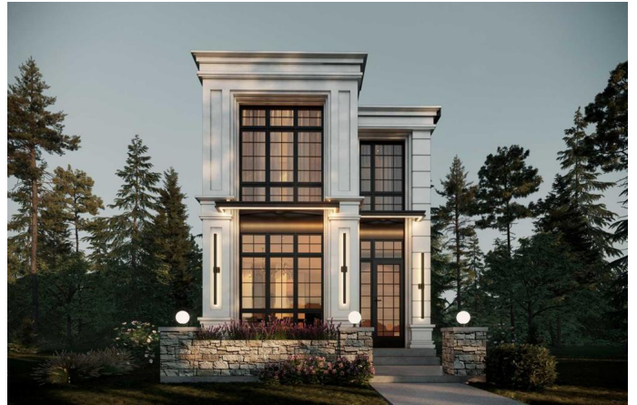
1623 21 Avenue NW (West)

Discover luxury and functionality in this spacious detached infill, nestled in the desirable community of Capitol Hill. Built by the award-winning ACE HOMES, this home sits on an impressive 27.5-foot WIDE LOT, offering over 3,000 SQFT of developed space that combines contemporary design with thoughtful details. With a total of 5 BEDROOMS, this home is ideal for families, multi-generational living, or those looking for rental potential. The layout includes 3 bedrooms upstairs and a 2-bedroom LEGAL BASEMENT SUITE with its own entrance. The main floor is designed for both elegance and convenience, featuring a dedicated dining room, a POCKET OFFICE, a walk-in BUTLERS PANTRY with a prep sink and beverage fridge, and a SOUTH-FACING LIVING ROOM that fills the space with natural light. A spacious mudroom and powder room add to the home's functionality. Upstairs, you'll find a large primary suite with a VAULTED CEILING, a custom COFFEE BAR, and a 5-piece ensuite with upscale finishings. Two additional bedrooms, each with tray ceiling details and their own 3-PIECE ENSUITE, provide a perfect balance of privacy and comfort for family members or guests. The legal basement suite, with separate mechanical room access, is fully equipped with a modern kitchen, including a fridge, dishwasher, OTR microwave, and range, along with IN-SUITE LAUNDRY. The basement's two bedrooms share a full