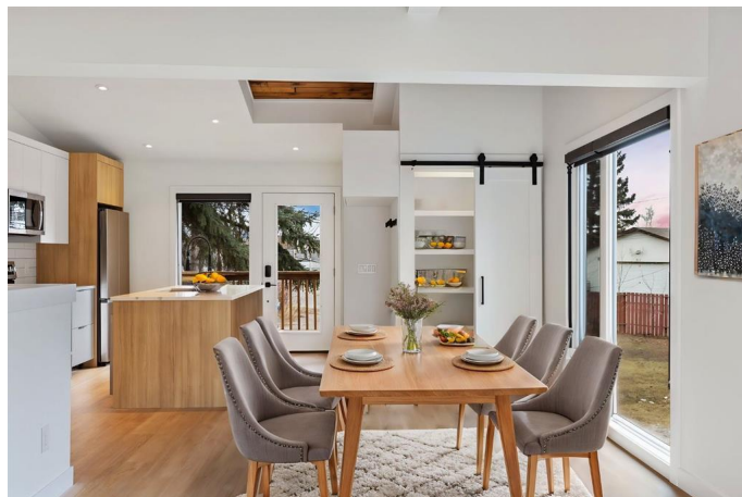
19A Arlington Pl SE, Calgary, AB